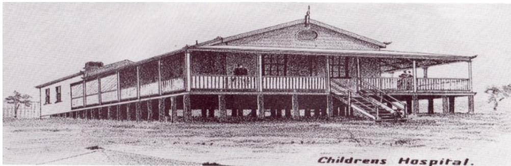
Rockhampton Children's Hospital.

Built by the Benevolent Society in 1889 the first building was a 30-bed hospital for children. Situated on the corner of Agnes and Denham Streets opposite the Girls' Grammar School. Administered by a joint committee of the Society and the Rockhampton Hospital.