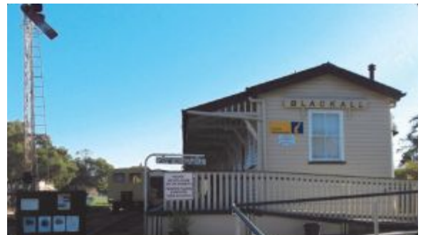
The Blackall Railway Station building now serves as a visitor information centre. 2015