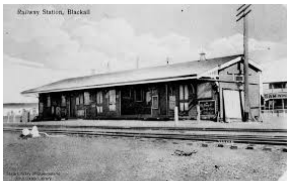
Blackall Railway Station in 1910