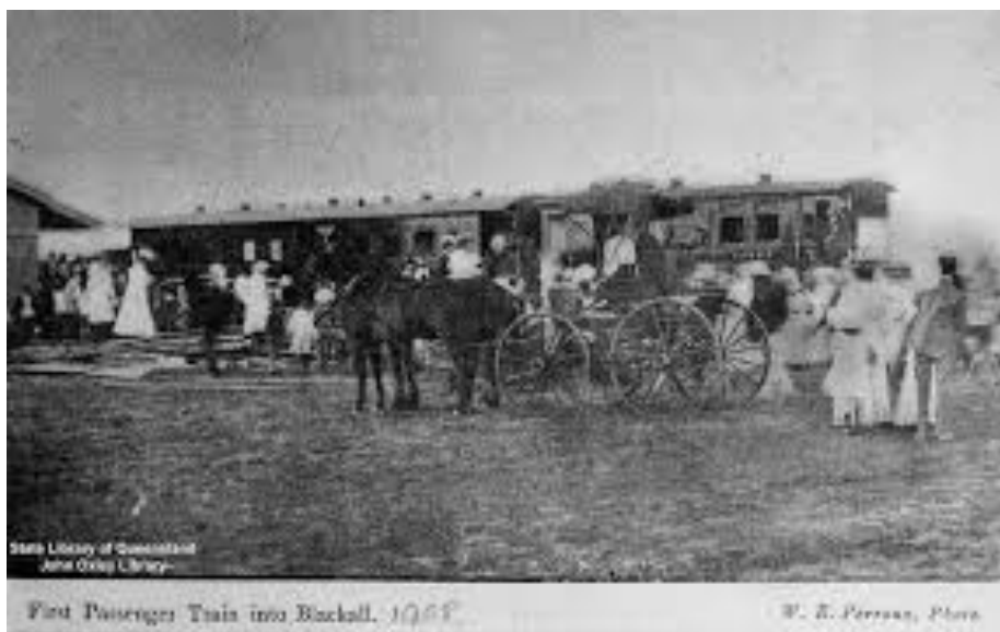
People gathered for the opening of the Blackall Railway Station. Passengers are boarding the first passenger train while a number of people wait on the platform and others are arriving in a horse drawn carriage. The Hon. George Kerr, Minister for Railways, opened the station in 1908.

Officially opened in 1908, the Blackall train station service would have afforded some mobility to Greta to visit family, though the travel was likely still to be far from luxurious, especially in the Queensland heat. For generations many from Blackall made the train trip to Rockhampton for educational, social and medical reasons. The railway line to Blackall closed in 2005. In 2015, the old train station building serves as a visitor information centre with one of last rail ambulances in Queensland on display. (Blackall withdrew use of rail ambulances in 1990.)